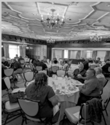
Below: Gathering of LICA members and Associates.