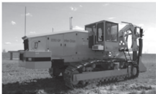
The Inter-Drain plow, three types, double link, single cantilever, or single link, each in three sizes. Cat, Cummins or Volvo power. Offset available.