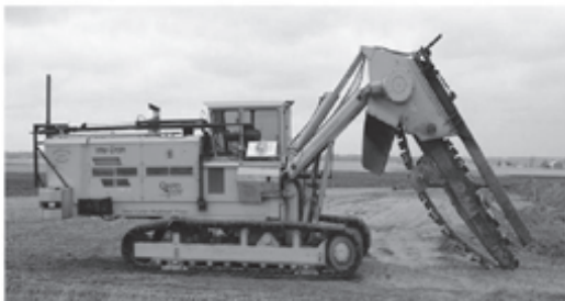
The Inter-Drain chain trencher. Four size choices, mechanical or hydraulic chain drive, vertical and offset available. Cummins, Volvo or Cat power.