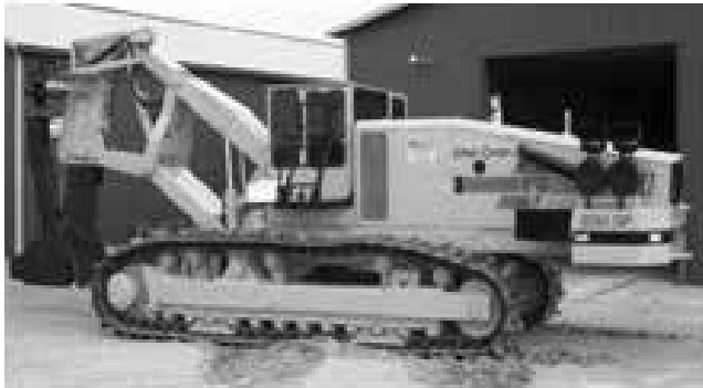
Inter-Drain 2050 GP

Your #1 Source For New & Used Trenchers & Plows